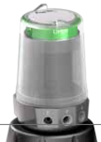
Long stroke with visual indicator