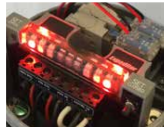
Convenient push button settings and high intensity LEDs