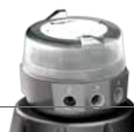
Standard stroke with no visual indicator