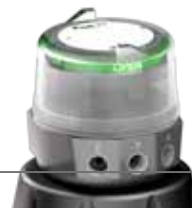
Standard stroke with visual indicator